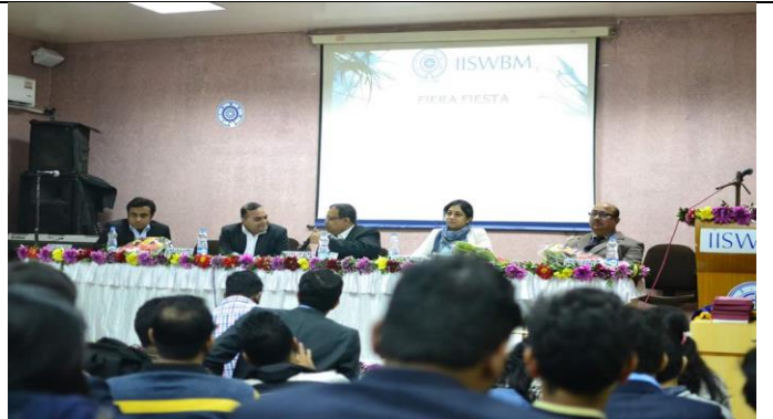
MBA-PS Students annual event – Fiera Fiesta