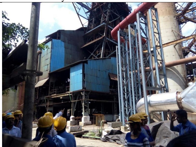
Energy Management Students industry visit to Tata Metaliks, Kharagpur