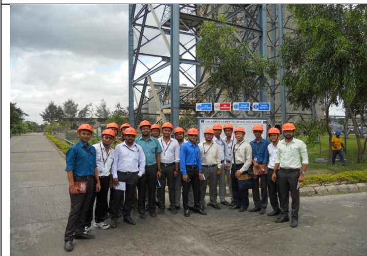
Energy Management Students industry visit to Ramco Cement, Kolaghat