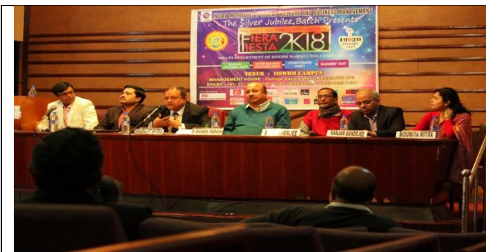
Panel Discussion during MBA-PS Students annual event – Fiera Fiesta