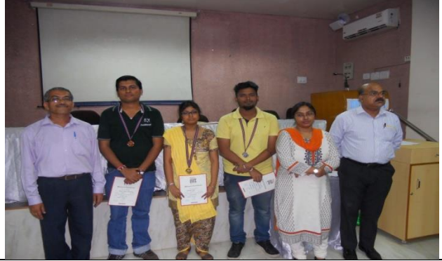
MBA-PS Students –Winners of Business Standard Quiz