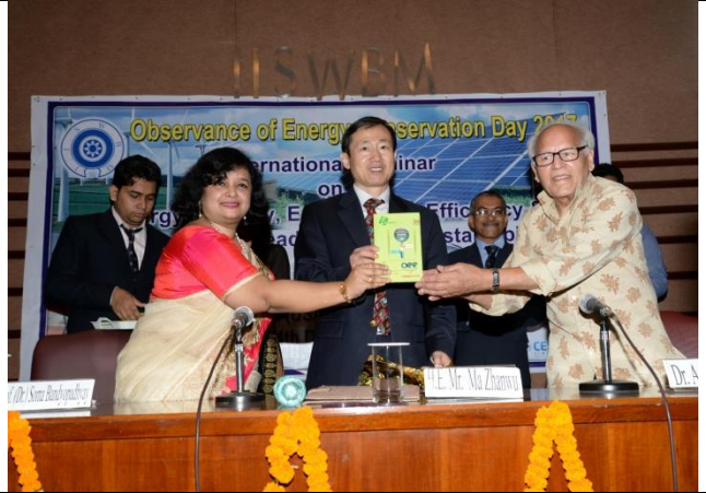
Publishing of Energy Modesty Diary 2017 in Energy Conservation Day – 14th December, 2017