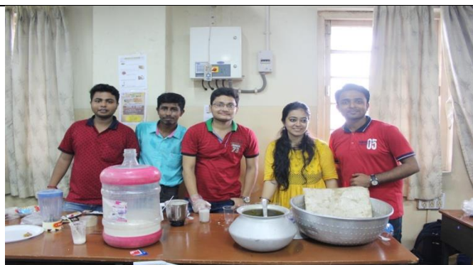
MBA – PS Students participating in other events of IISWBM – Khaye Jao