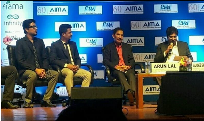
Students of MBA-PS department sharing stage with eminent personalities in a Business Talk at IIM, Kolkata