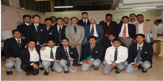
MBA-PS Energy Management students organize Energy Conservation Day – 14th December every year