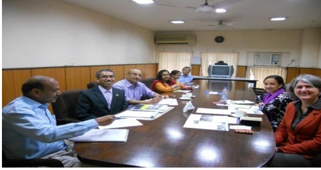
Faculty visit from foreign University – for Energy Management Department