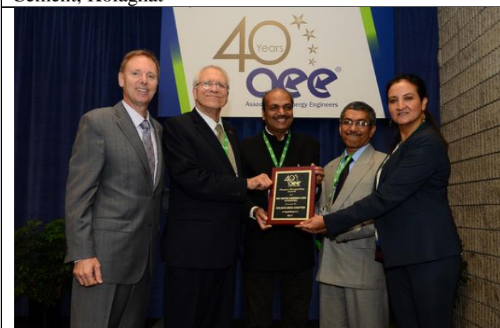
AEE-Kolkata/Energy Management Dept. Receiving Recognition Award at WEEC in USA