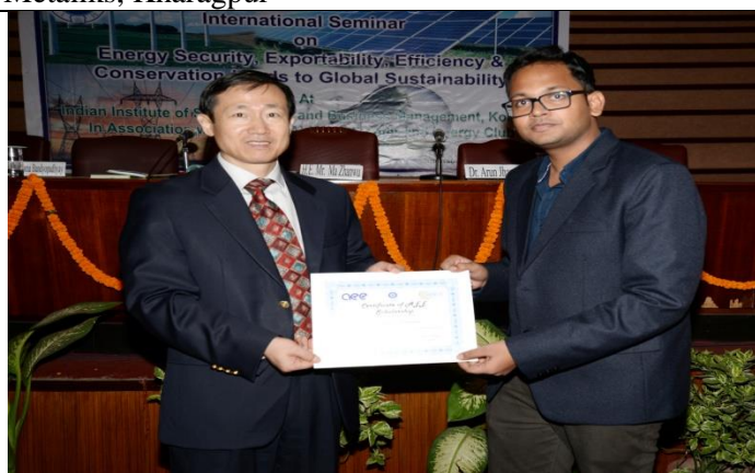
Energy Management Student receiving International Scholarship from Association of Energy Engineers (USA)